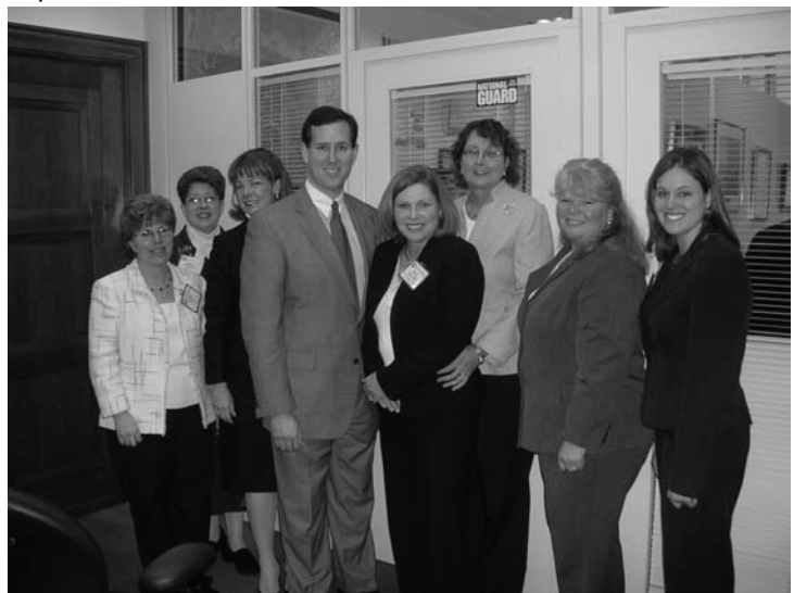
Pennsylvania nurses meeting with Senator Santorum during NIWI (Nurse In Washington Internship) held March 12-15, 2006

The bill was referred to the committee of transportation one June 30, 2006.